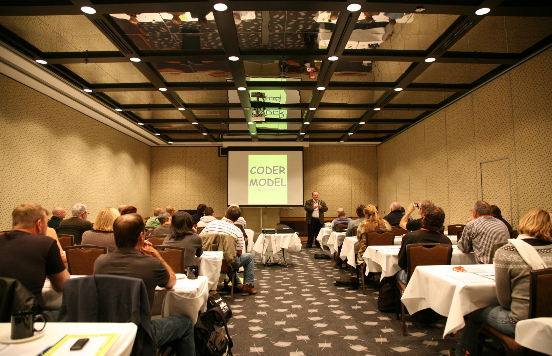
The meeting hall of 87 th ISA annual conference July 25, 2011 in Sydney Australia