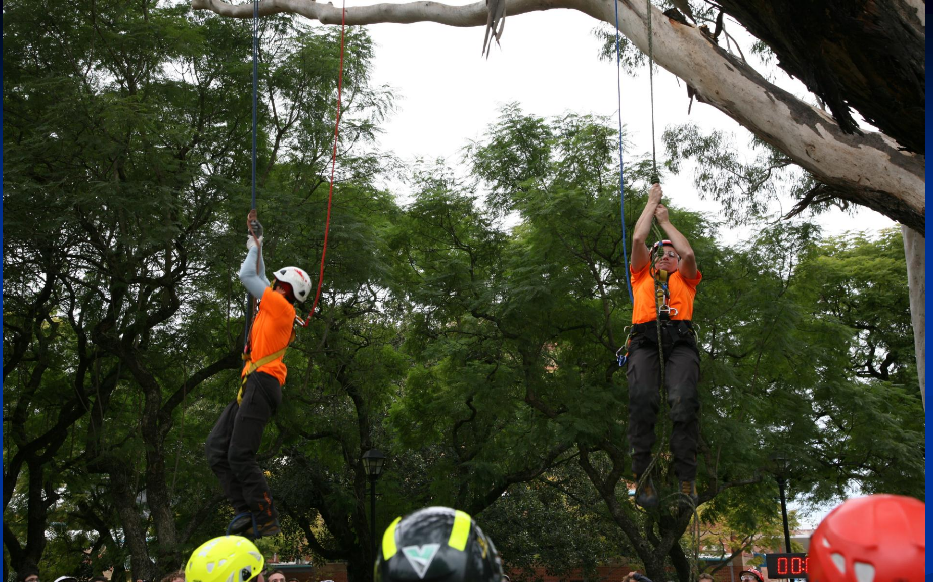
International Tree Climbing Championship(ITCC) Hosted by ISA July 23-24 2011,in Sydney