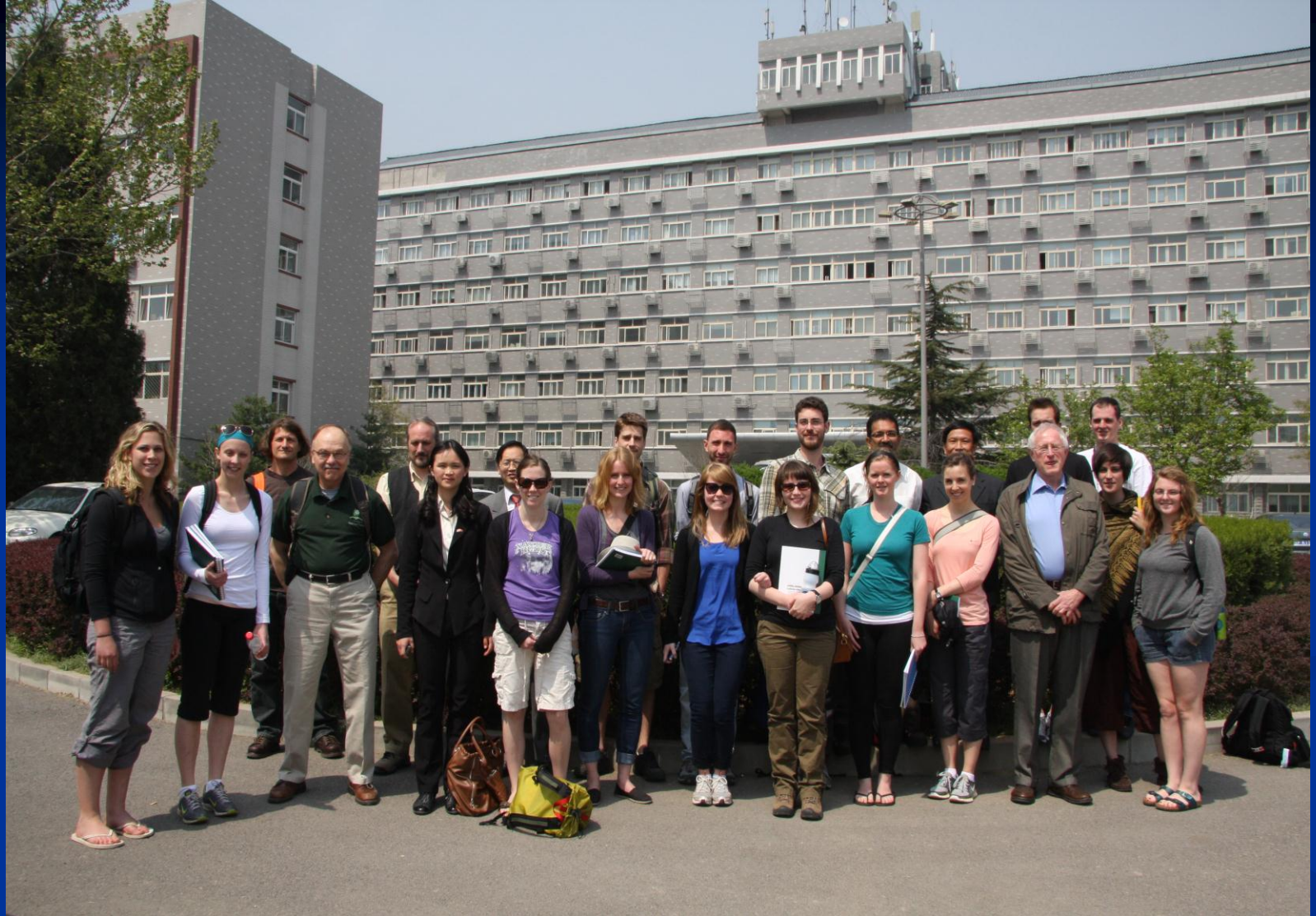
The group of Canadian Institution of Forestry(CIF) visited Chinese Society of Forestry on April 2011