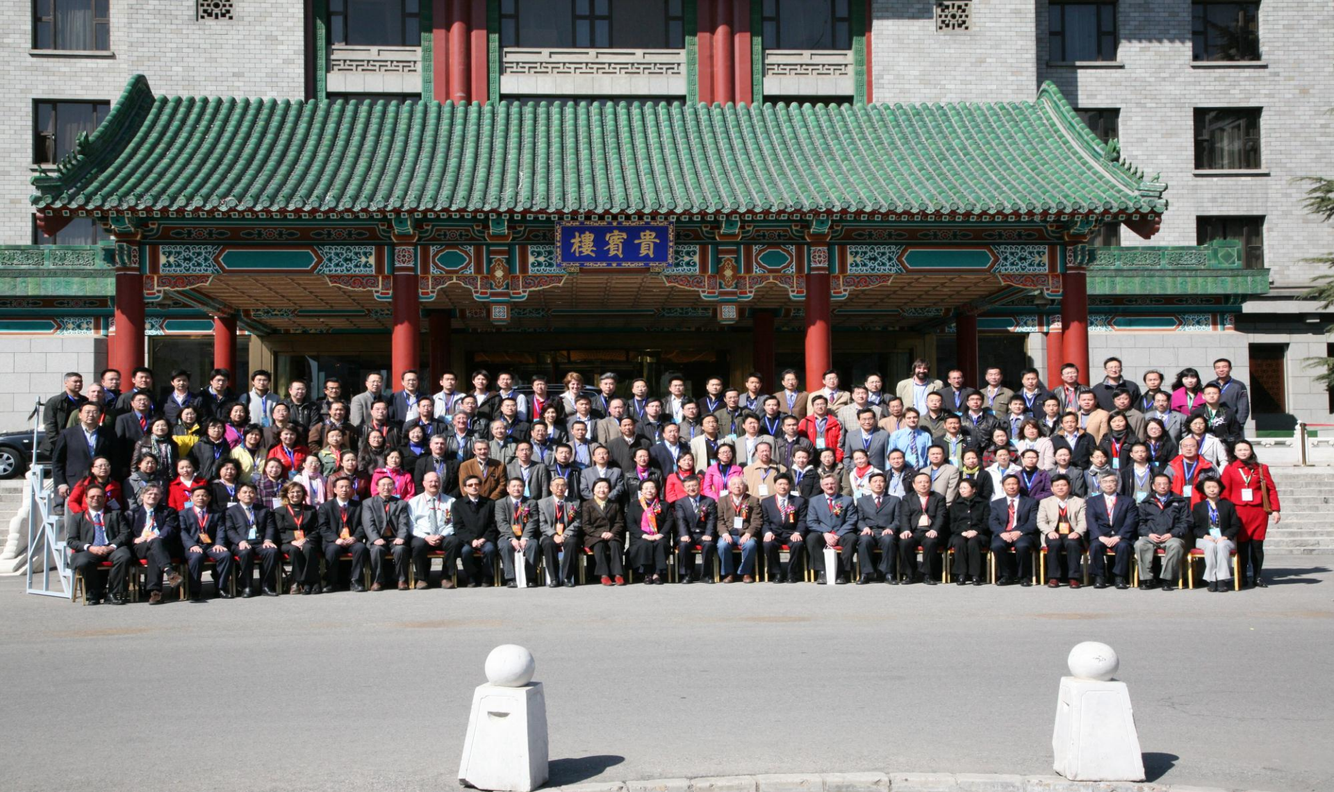
International conference on the efforts in response to forest related Natural Disaster –the 1st Forest Science Forum April 12-14 2010 in Beijing